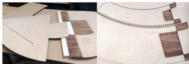
Figure 3: Physical assembly of laser cut and engraved components.