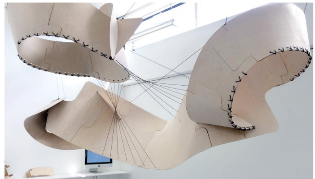
Figure 4: Full-scale loop structure installation.

As a result of this study, maintaining an equilibrium between physical and digital mediums manifested a cyclical feedback exchange throughout the design process. In an iterative design process, search for conceptual and structural design solutions will continuously redefine the problem [39]. Benefiting from creative skills of the designer and machine capability to the same degree originated quick and efficient solutions by linking design exploration to material realization (Figure 4) [44]. On the other hand, implementing an integrated method offered alternative design strategies for tackling the physical and digital limitations we have encountered during the process (e.g., undetected surfaces while 3D scanning, unstable laminated joints, etc.).