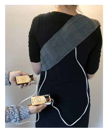
Figure 6. Soma Bits: designing bodily engagements with a first-person perspective using a toolkit of simple interactive devices.