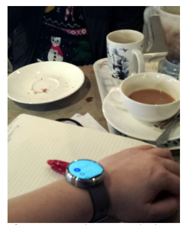
Figure 4. Cecchinato studied how smartwatch use and non-use affect social and personal interactions with respect to multidevice interactions and work-life balance.

and Hassenzahl point out that without the latter dedicated interpretative step, detailed accounts of autoethnographical design risk remaining accounts of attempts to design and will hardly contribute to the body of knowledge in HCI and Interaction Design [3].