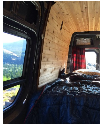
Figure 2. Living in a prototype: Desjardins investigated the ongoing and slow process of turning a van into a home.