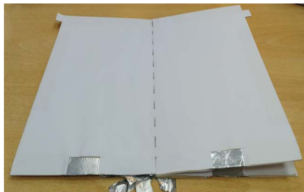
Figure 3: Cardboard lined book.

used, affecting the operation of the book, because the contacts could break.