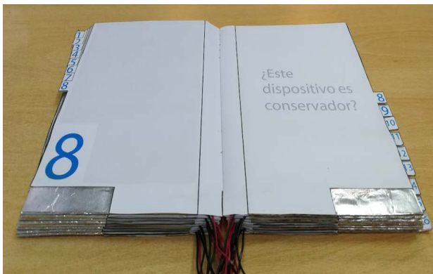
Figure 5: Book used magnets of 1mm thickness.

the back cover of the book, while the center pages are connected, as shown in Figure 5.