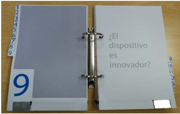
Figure 4: Ring-type book.

the back cover of the book, while the center pages are connected, as shown in Figure 5.