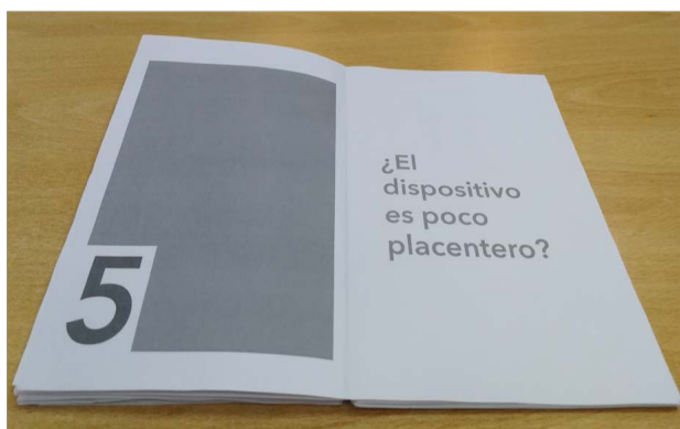
Figure 1: A page of the book with the question and question number.

The first version of the book was made using bond paper sheets, electrically conductive paint (Bare Conductive Electric Paint Pen 10ml) and electrical cables. To detect the current page, we placed conductive paint on the bottom edge of each page. The idea was that the conductive paint would generate contact with the front and back pages when the page was closed and a signal would be sent to the controller by means of the electrical cables, otherwise no signal would be sent if the page is open. The bottom of the page of the question number is connected to 5V, while the contact of the question page is connected to the controller to receive the signal. In this way, we can identify on which page we are.