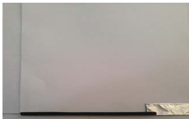
Figure 2: Aluminum foil was added over the conductive paint.

In the tests, there was an improvement in the detection of the open page, but the detection was still not completely reliable. In addition, it was evidenced that the paper was prone to be torn when